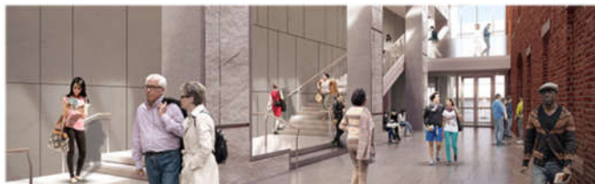
The Peabody Essex Museum Expansion, opening September 2019