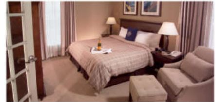
Salem Waterfront Hotel & Suites