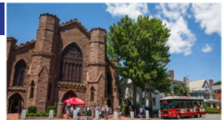
The Salem Witch Museum and Salem Trolley

Find complete information at HauntedHappenings.org .