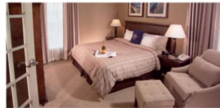
Salem Waterfront Hotel & Suites