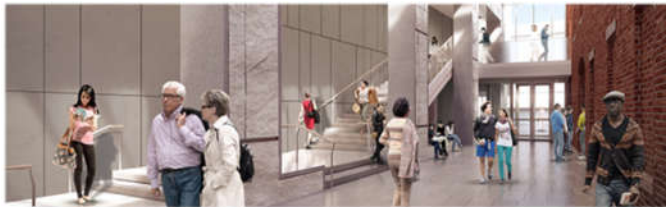
The Peabody Essex Museum Expansion, opening September 2019