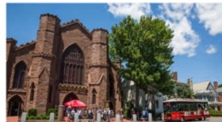
The Salem Witch Museum and Salem Trolley

Find complete information at HauntedHappenings.org .